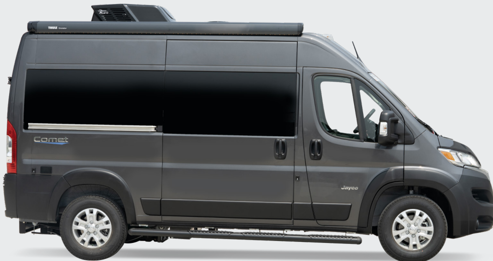
Granite Van (Not Pictured: Silver Van)